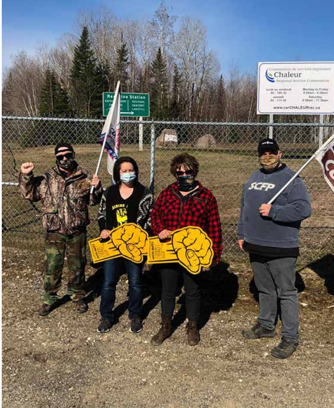
CUPE 4193 members in lockout.

As most of the country's labour negotiations have slowed down due to the COVID-19 crisis, one New Brunswick employer is keeping its staff in locked out: the Chaleur Regional Service Commission (CRSC).